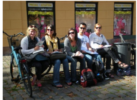
Students work on a mapping exercise

[13:00] Apply 12 Quality Criteria, Life/Space/Building and Behavioral mapping to assigned city spaces